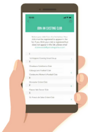
3. Select your club from the list