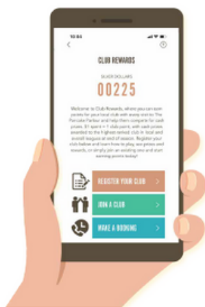
2. Click on Join a Club