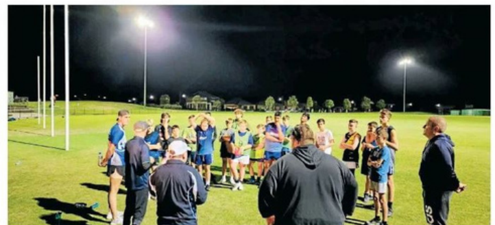
The young Roos are pioneering a return of umpire engagement.